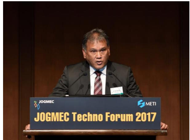
Dr. Ego Syahrial Ministry of Energy and Mineral Resources, Indonesia Indonesia's Oil and Gas Infrastructure Development