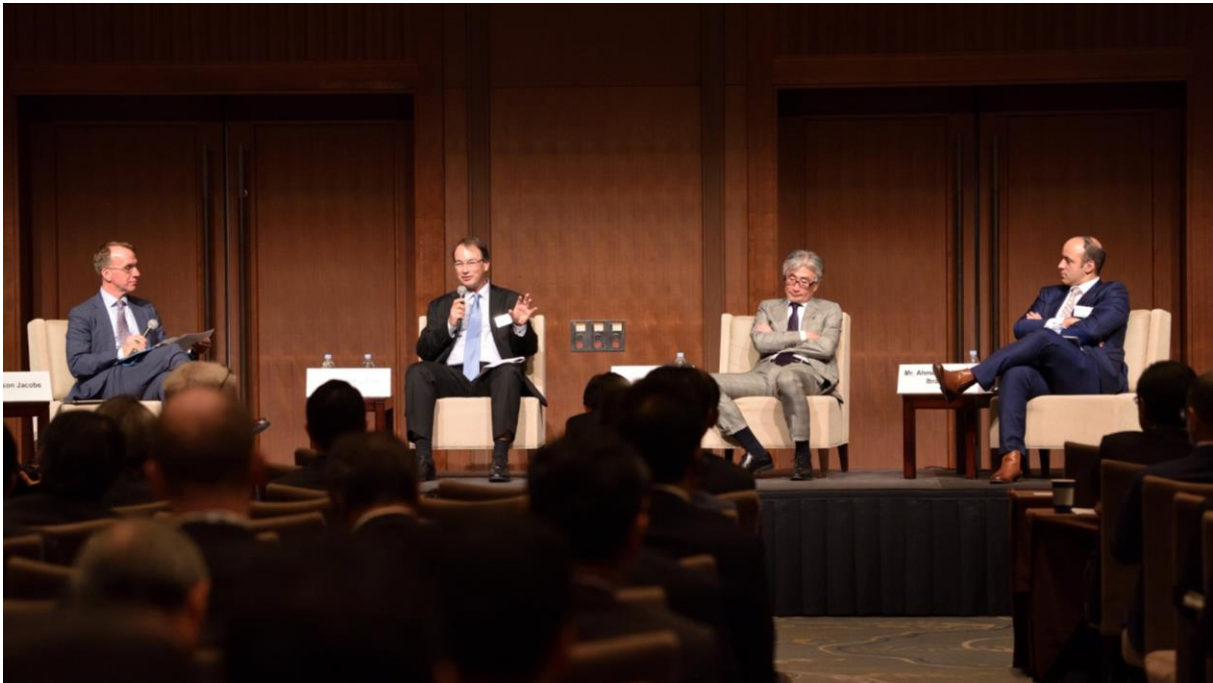
Day1: Panel Discussion: "Technology Innovation"